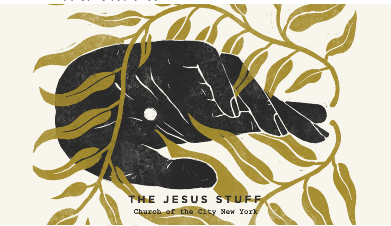
WEEK II - Radical Obedience